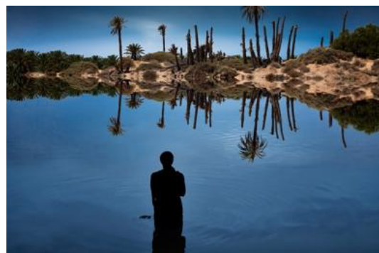
Sama Alshaibi, Fatnis al-Jazirah (Fantasy Island) , 99 in x 66 in, digital C-print face-mounted on to Diasec plexi, 2013 © Sama Alshaibi

No 1 Business Centre, 1 Alvin Street, Gloucester GL1 3EJ