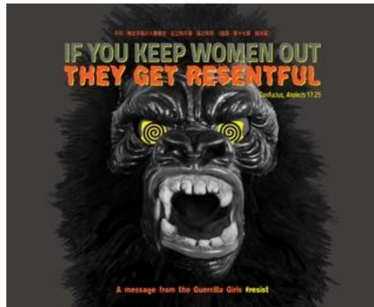
Guerrilla Girls, If You Keep Women Out They Get Resentful, 2018 , © Guerrilla Girls,. Courtesy guerrillagirls.com