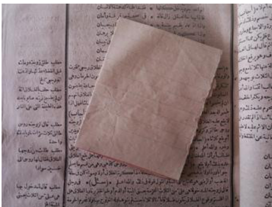
Emily Jacir detail from ex libris (AP 2356) 2010-2012 Installation, public project and book Commissioned and produced by dOCUMENTA (13) with the support of Alexander and Bonin, New York and Alberto Peola Arte Contemporanea, Torino. NB: keep lower case for title