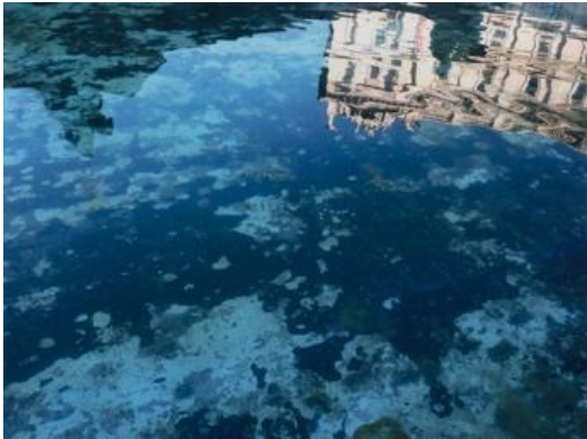
Emily Jacir la mia mappa , 2013. C-print on Fujiflex Crystal Archive paper. Courtesy of Alexander and Bonin © Emily Jacir 2013 NB: keep lower case for title