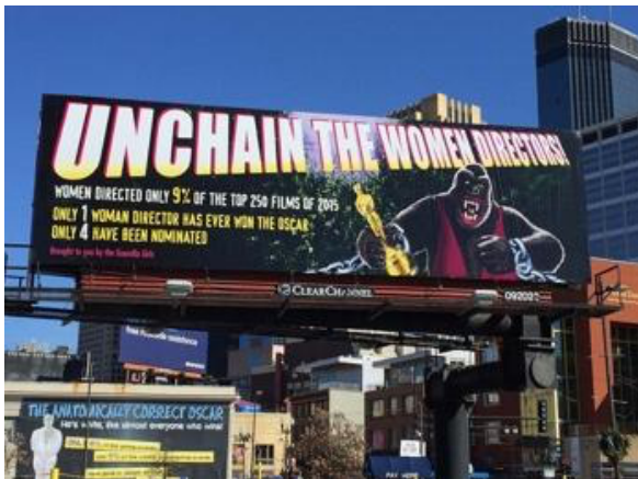
Guerrilla Girls, Unchain The Women Directors! Guerrilla Girls Twin Cities Take Over, Minneapolis, 2016