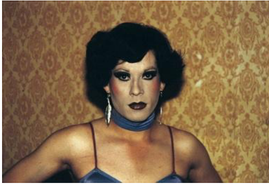
Paz Errázuriz, Evelyn © Paz Errázuriz