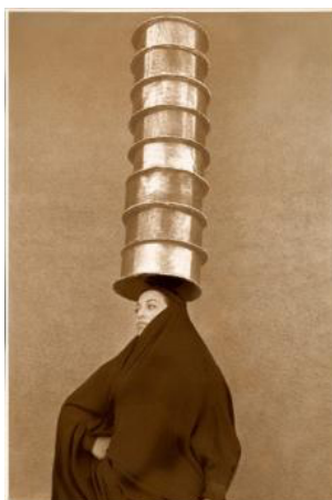
Sama Alshaibi, Water Bearer II , photogravure print and blind embossing with transparent ink relief rolled on Stonehenge white 100% rag paper, 25 in h x 20 in w, 2019 © Sama Alshaibi