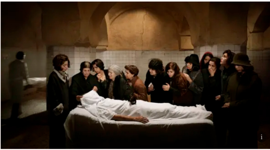
Assassinations, torture, accidents, suspicious and natural deaths. Azadeh Akhlaghi's photographs are a record of national suffering and a landmark in the turbulent times of modern Iranian history.