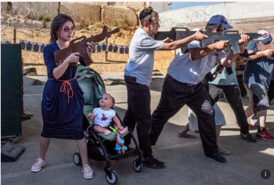
Her project Sacred Space Oddity examines the overlap between the sacred and secular life of Palestinians and Israelis and questions the dichotomy between secular and religious practices.