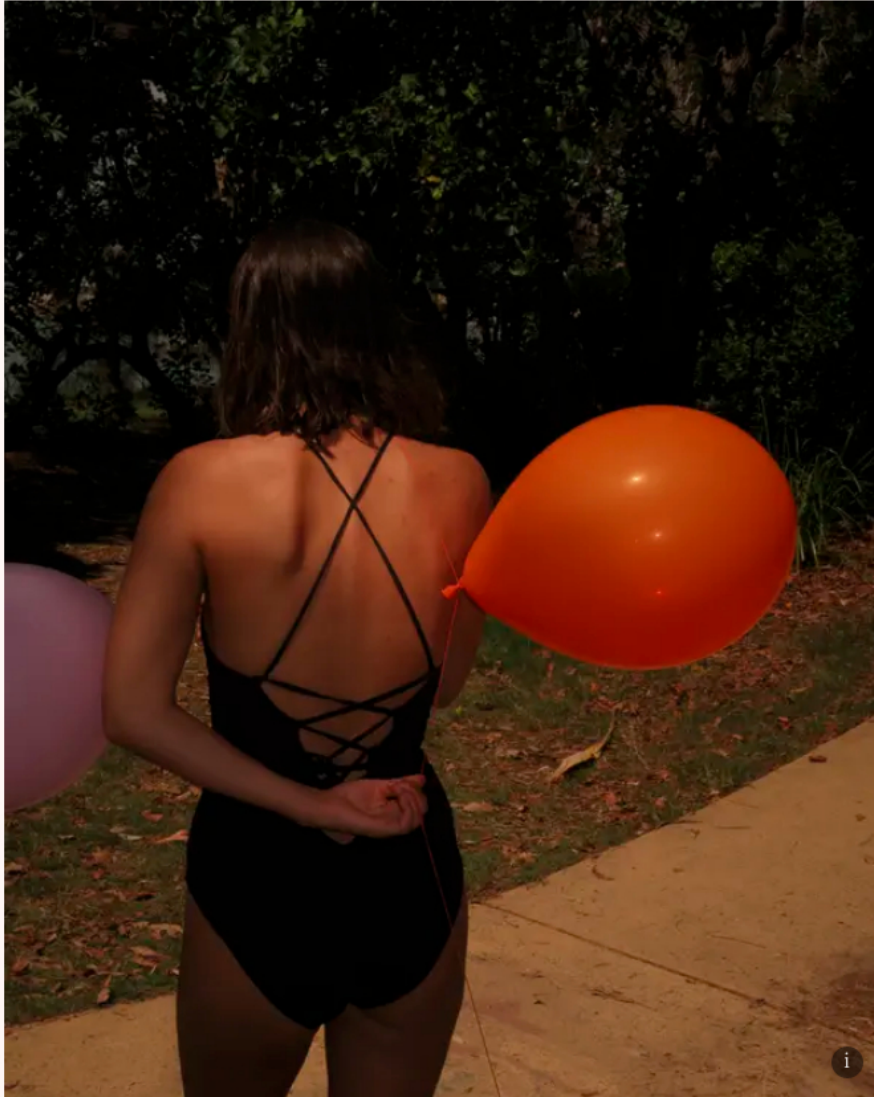
Her latest series, Swell, is a protest against the Australian government's restrictions on environmental activism.

Koenning is a German photographer living in Melbourne, Australia. While the starting point of her work lies in a traditional photographic document, the visual style reflects her intuitive and experimental approach.