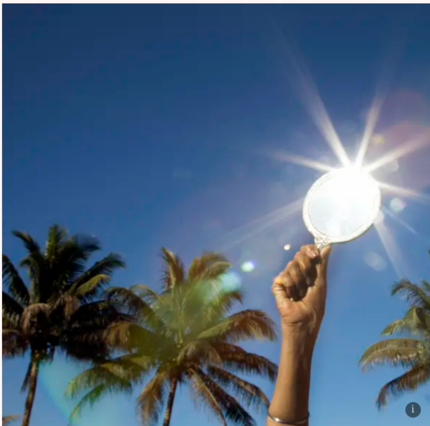
Image from the Kikau Street series. "This mirror was used by my mother when she wanted a ferryman to come for us. The reflection of the sun was a signal. we got on the boat and drove."